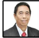
PDG. TEODORO LOCSON COUNCIL ON LEGISLATION DISTRICT REPRESENTATIVE